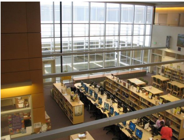
Ardmore Elementary: Library Central to Classrooms