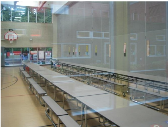
Cherry Crest: Cafeteria opens to the Gym