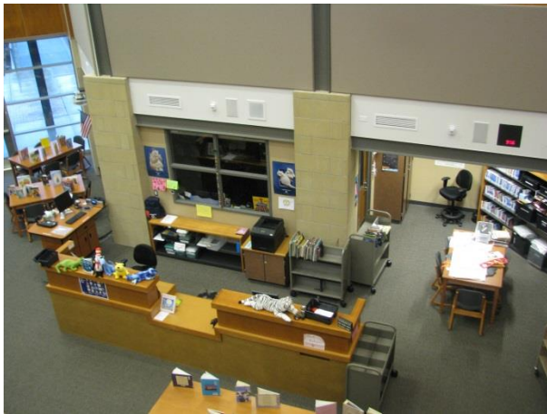
Briarwood: Centralized Library