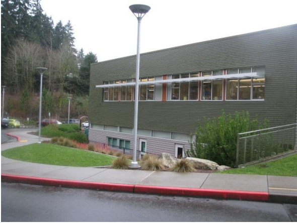
Ardmore Elementary: Two-story Structure