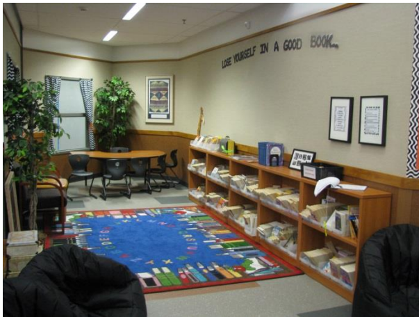
Briarwood: Flexible Learning Environments