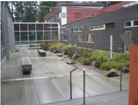
Cherry Crest: Learning Courtyard