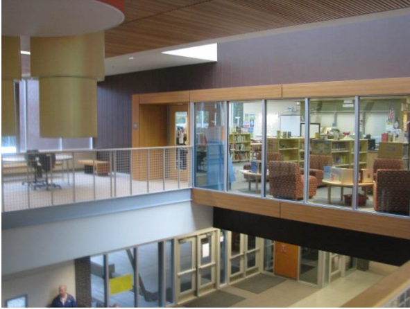
Cherry Crest: Second Floor Library