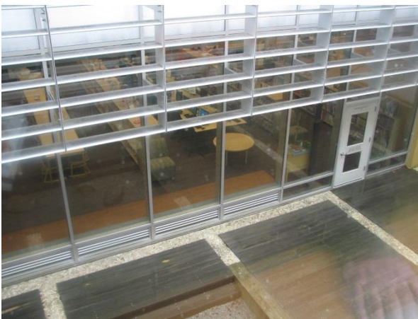
Ardmore Elementary: Interior Learning Courtyard