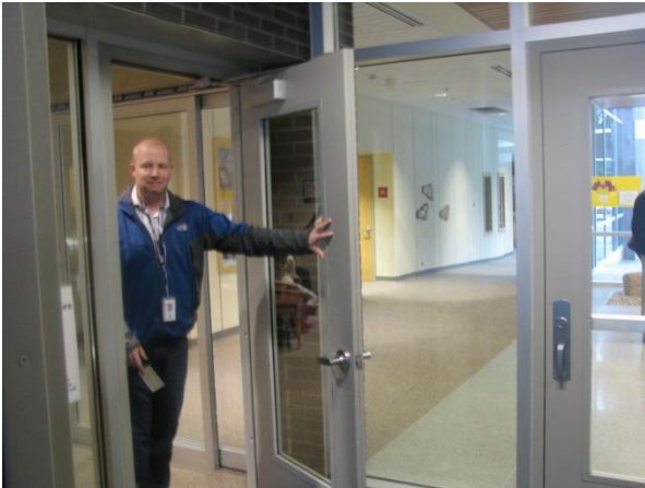
Cherry Crest: Secured Entrance