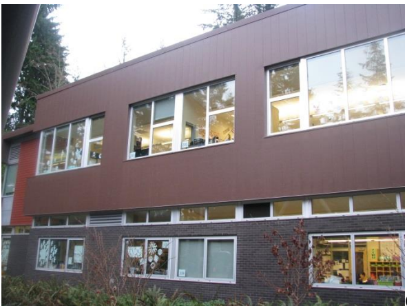
Cherry Crest: Two-story building