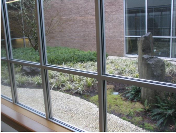
Ardmore Elementary: Natural Light throughout