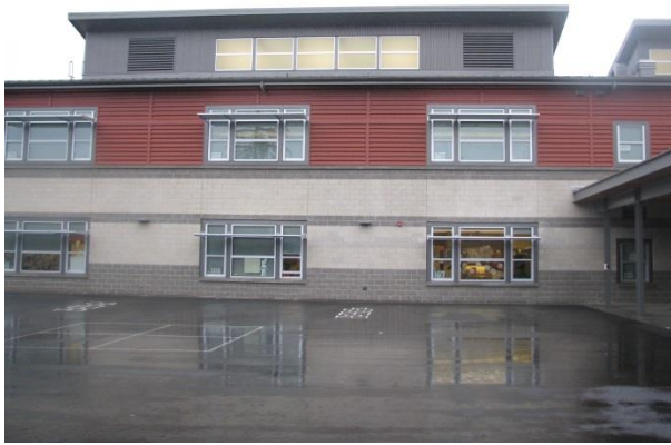
Briarwood: Two-story structure