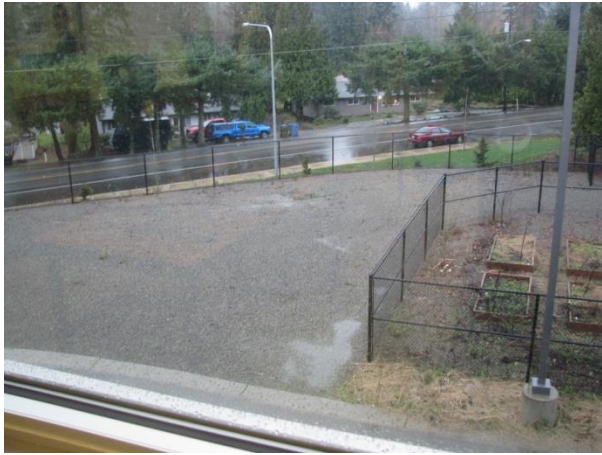
Briarwood: Secured Grounds