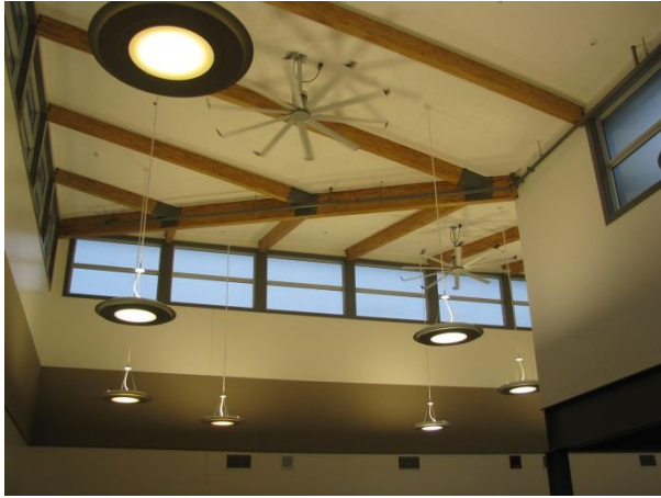
Briarwood: Energy Efficient Systems and Fans